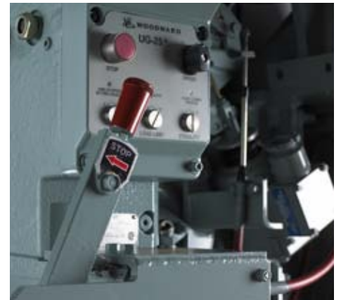
Manual stop lever