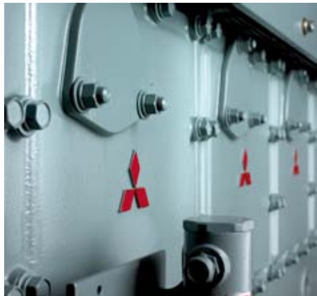
Cam chamber cover

All pumps, oil coolers and filters in the cooling water, lubrication and fuel systems are compactly installed on the engine enhancing comfort in the working area and provide an affordable space. The overlap distance between the crankshaft main journal and pins has been increased to reduce the cylinder pitch, thus reducing the overall engine length.